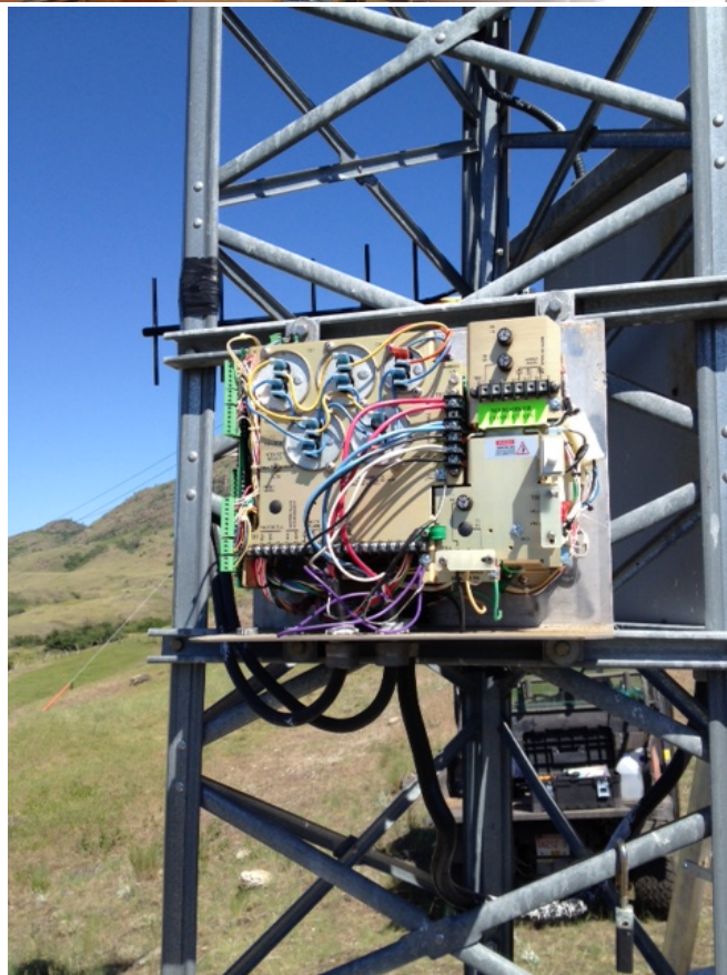
Inside of current controllers